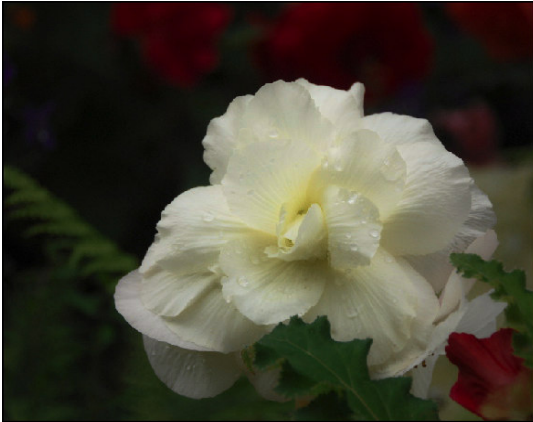
Flower after 7 Control Points added in Viveza - No selections or masks were used.

How does U-Point technology work? Each Control Point identifies the unique elements where it is placed, including the position, color, saturation and texture. Changes made with that control point affect similar elements within the range of the size slider. The effects of the Control Points are smoothly applied to create a seamless result without any edge selection effects.