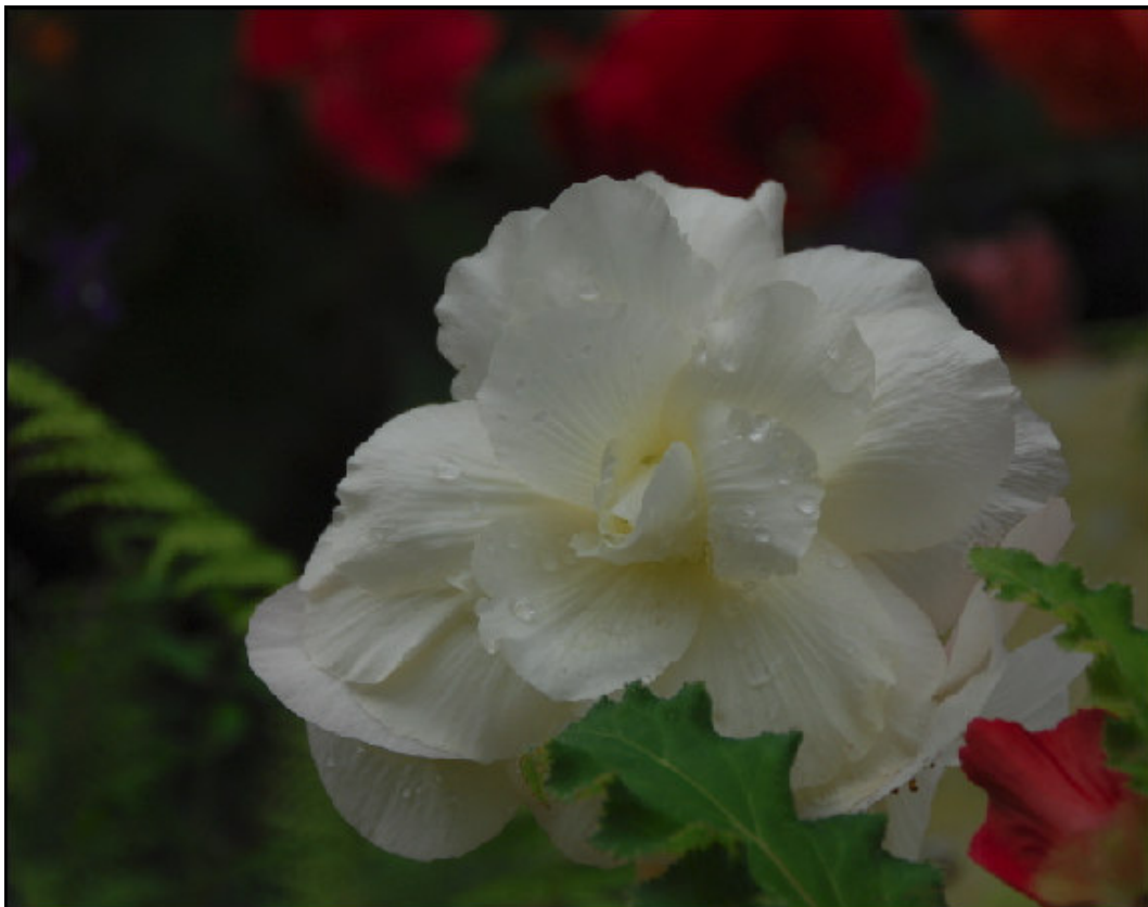
Original Flower with no adjustments.

I made 3 changes to the flower picture with 3 Control Points, lowering the brightness, contrast and saturation to reduce the 2 background elements (red flowers & green leaves), and increasing them along with the warmth slider to bring out the white rose. When I was finished adding Control Points and making adjustments, I clicked OK and the changes were made as a new layer in my Photoshop document. You can see the before and after picture below. All those color adjustments were made quickly and with a minimal effort - no tedious selections, and best of all, no unsightly selection edges! A free 15 day trial is available, and you have got to try this program to see its magic. There are easy-to-follow tutorials and examples of using Viveza online at www.niksoftware.com