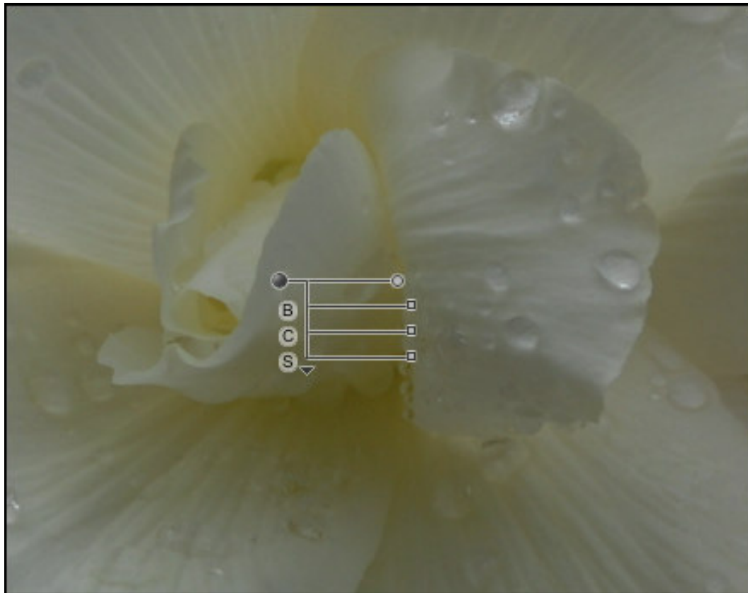
Control Point showing the Size, Brightness, Contrast and Saturation sliders